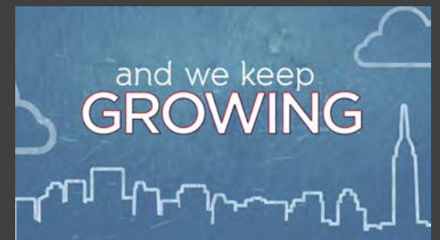
Maybe "Reaching" could look like this?