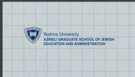
The drafting supplies and hand are animated photos. They draw the lines around the text.