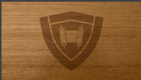
Blueprint rolls out across a desk.