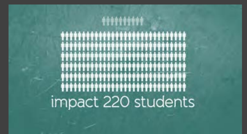
After we see the faculty, the students unfold underneath them.